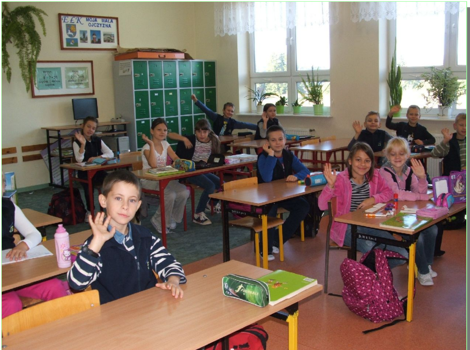
Here are our younger students.