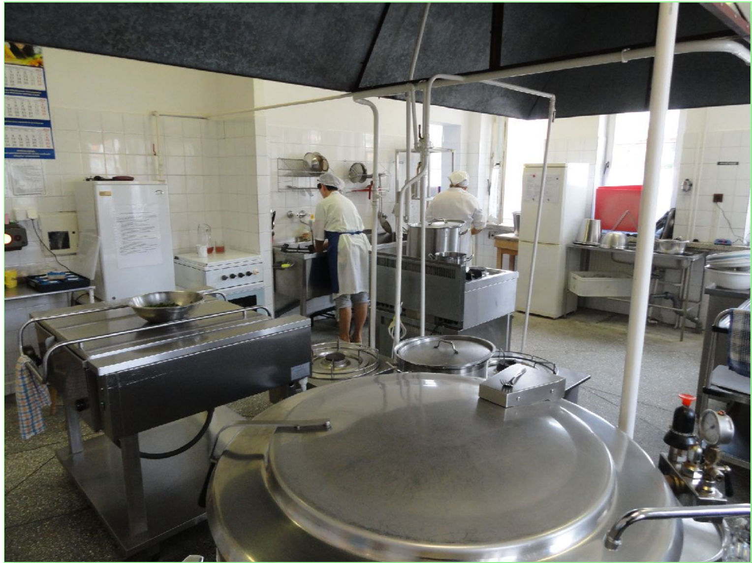
School kitchen. Our cooks prepare delicious meals for us.